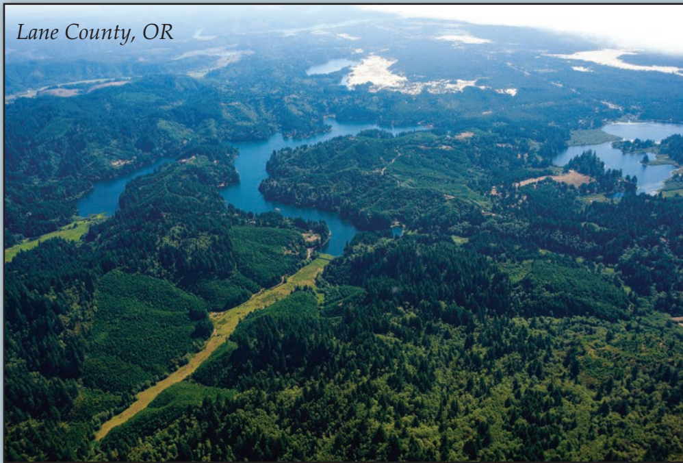
Lane County, OR