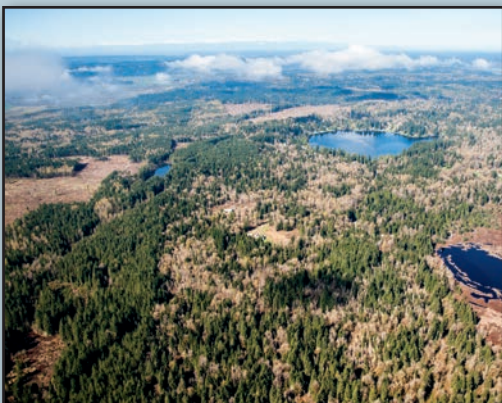
Snoqualmie Valley, WA