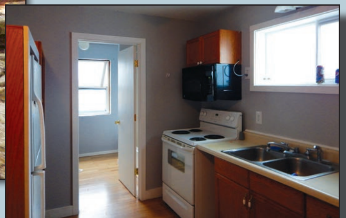
Apartment above arena

• Bank-owned equestrian facility, on 20± acres, that can accommodate 44 horses. Improvements include a 21,024± square foot horse arena with apartment, six-stall barn, hay sheds, shop, and residence. Property has water rights and is fenced and cross fenced. Bank-financing available. $520,000