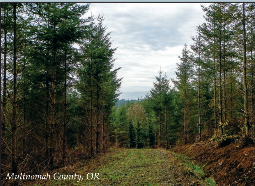
Multnomah County, OR