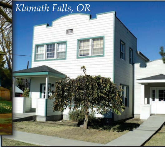
Klamath Falls, OR

• Bank-owned , two-story, 4,344± square foot building with three bedroom, two bathroom apartment, 2,000± square foot shop and garage, near community college in Centralia, WA. $75,000