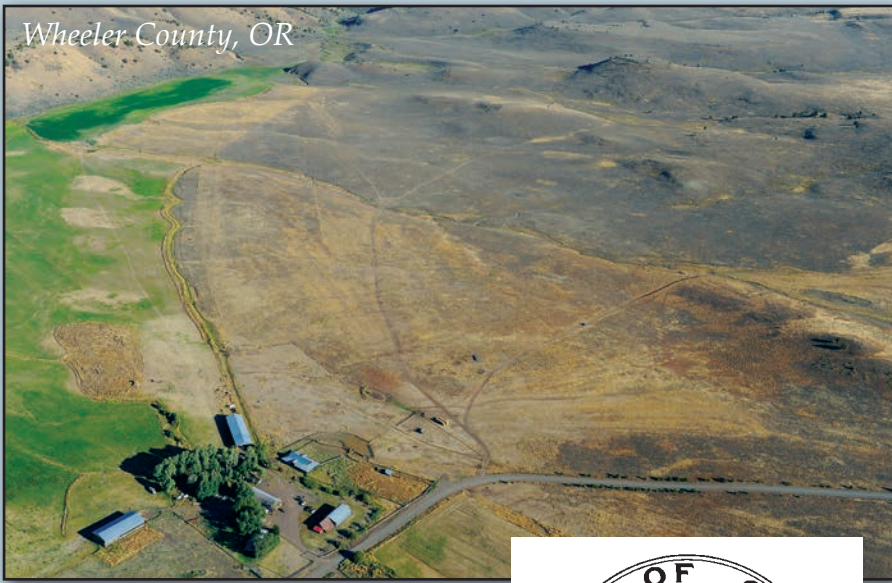
Wheeler County, OR