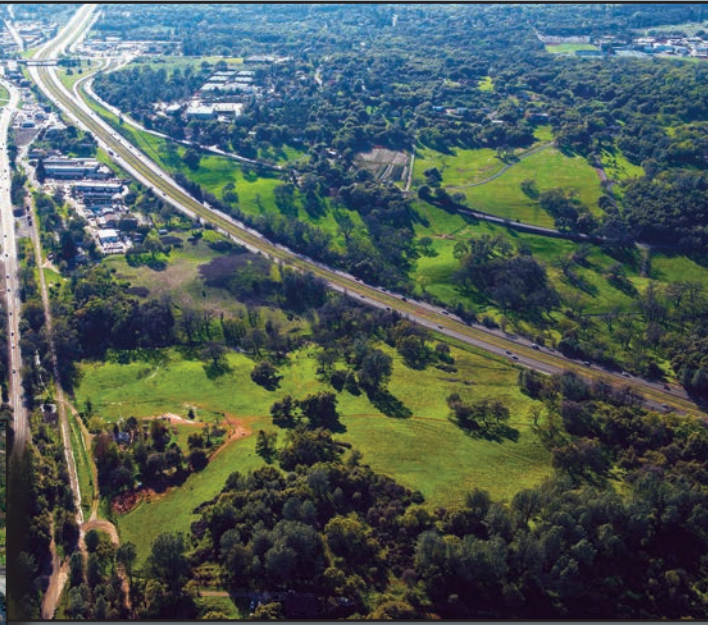
Near Cameron Park, CA