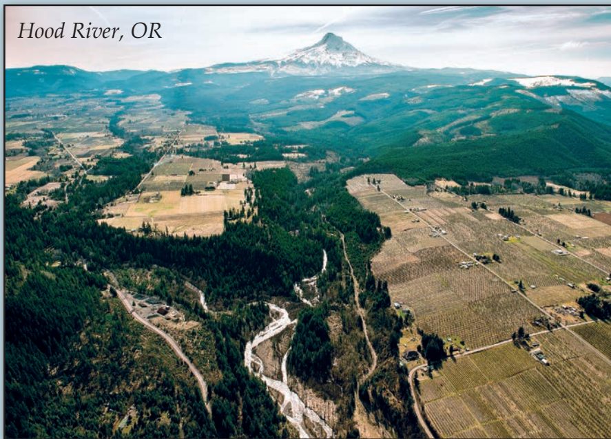
Hood River, OR