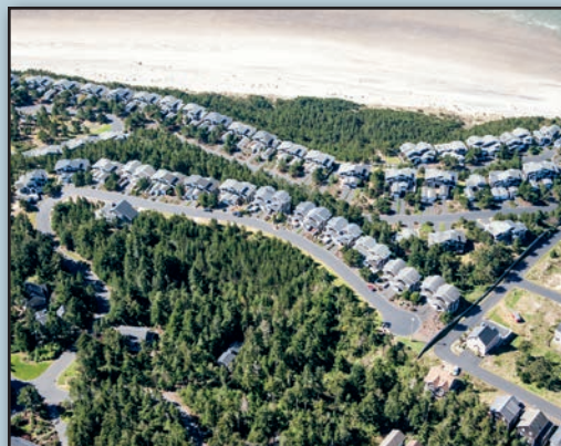
The Capes, OR