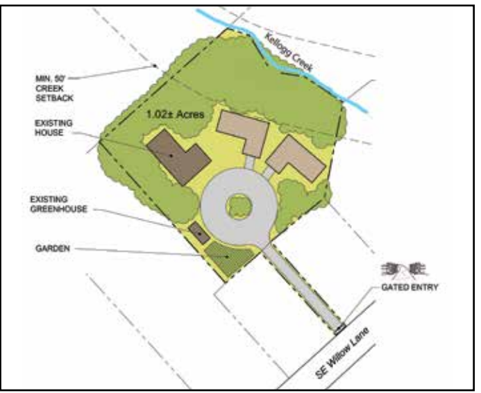
Please Note: Sketch plan is conceptual only. Neither the Seller nor its agents have submitted plan or made any applications to a public agency.

DESCRIPTION: This 1.02± acre site contains a 2,500± square foot occupied three bedroom, one bathroom home. Also, there is a 1,600± square foot