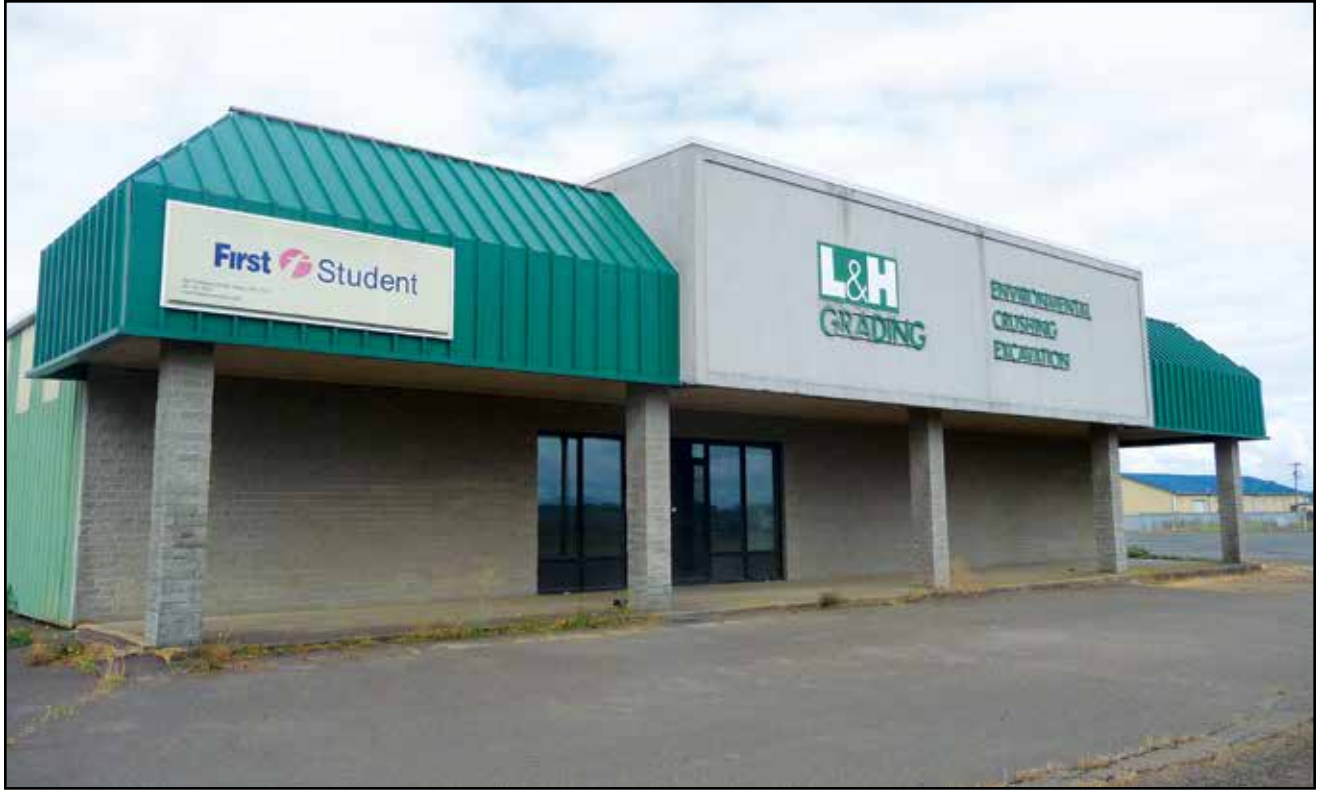
Building on Parcel A

Please see Supplemental Information Package for details regarding lease.