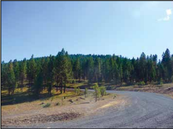
USFS Road 10 provides excellent access throughout the property from Highway 395