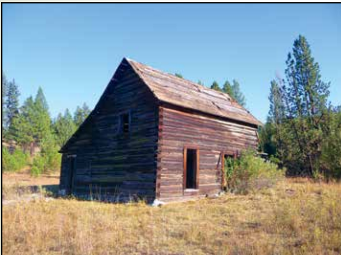
Old hunters' cabin located by Desolation Creek in southeast section of property