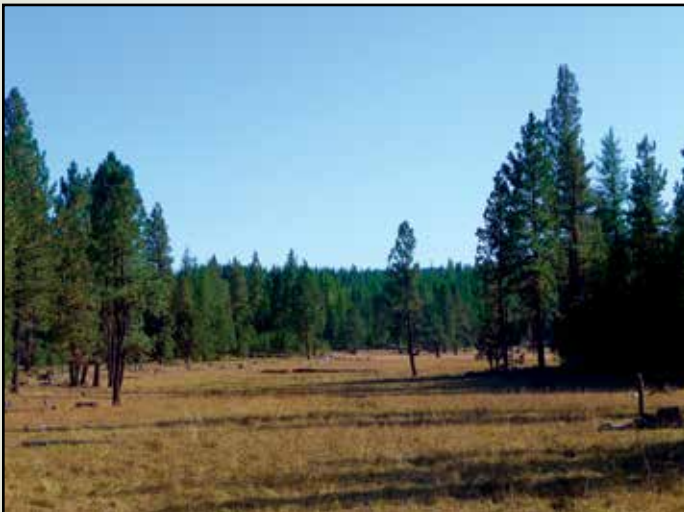
Wassen Meadows is used for grazing