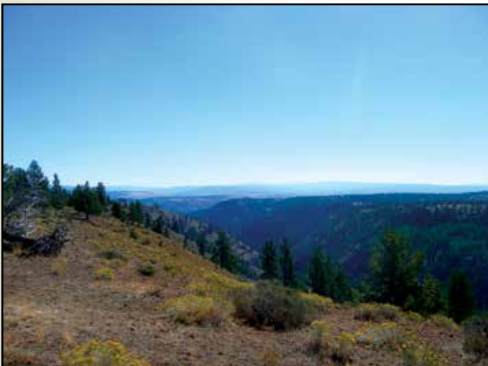
View southeast to Five Mile Creek and North Fork John Day River Valley