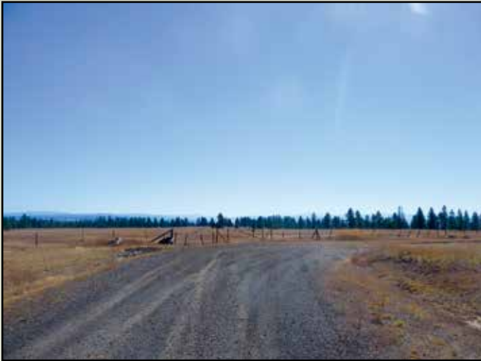
Main entry by "Elk Gate" in southwest corner of property