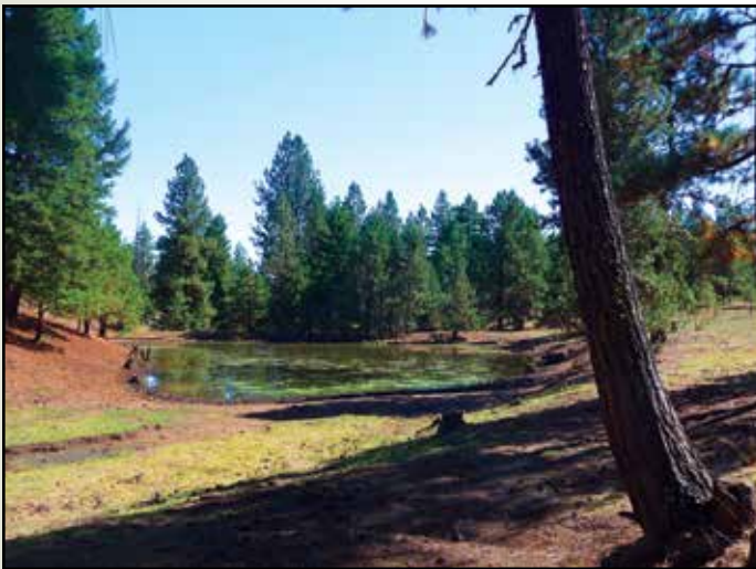
One of two stock ponds located on the property