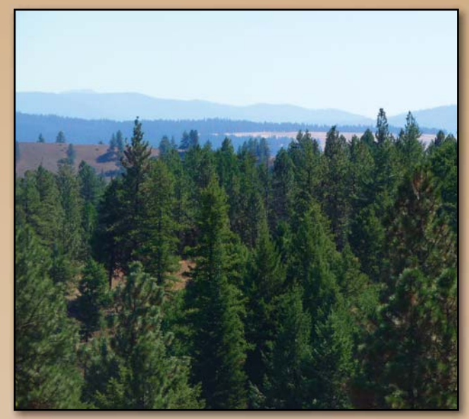
Wilkins Creek has an estimated 10,734 MBF