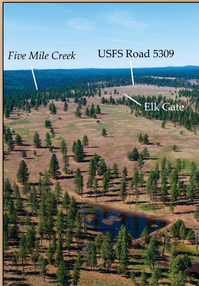
Large meadow by Elk Gate could accommodate airstrip and base camp

Access to both the northwest and southwest is from Highway 53. USFS Road 5309 provides access to the southwest corner by Elk Gate. USFS Road 5310 provides access to the northwest corner of the property. Elevations range from 3,500