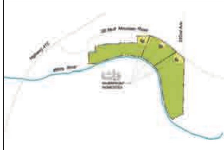
Please Note: Sketch plan is conceptual only. Neither the Seller nor its agents have submitted plan or made any applications to a public agency.