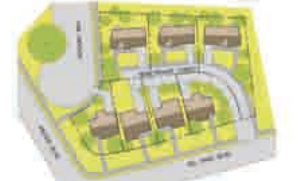
Please Note: Sketch plan is conceptual only. Neither the Seller nor its agents have submitted plan or made any applications to a public agency.

DESCRIPTION: This 24,394± square foot residential development site known as Academy Place has approval for the development of seven single-family homes. The approvals specify twostory plans ranging in size from 1,300 - 1,400