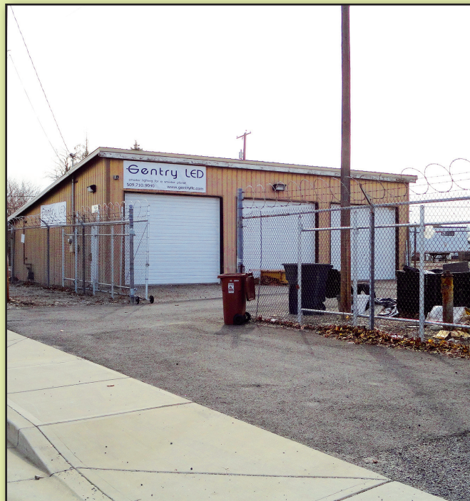
Left: Building One, 3,612± sq. ft. with office/ warehouse

There are no known environmental concerns associated with either property.