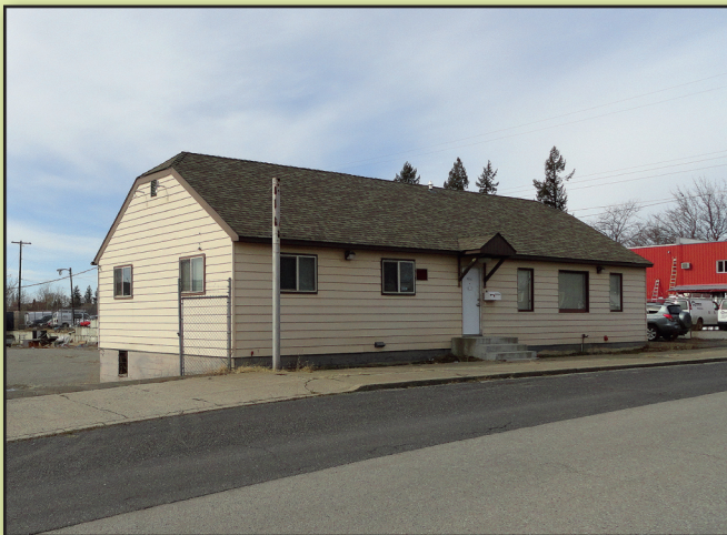
3,120± sq. ft. building

The property is located north of I-90 and Trent Street with frontage on North Helena Street. Just south of the property is the historic South Perry District, one of Spokane's more eclec-