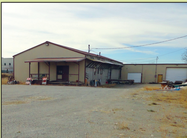
Buildings Two and Three with total of 5,199± sq. ft.

tic commercial neighborhoods, attracting restaurants, bicycle shops, coffee shops and bakeries. The campuses of Gonzaga University, and Washington State University – Spokane, are located within minutes. Downtown Spokane is within a 5 minute drive. The Hamilton Street interchange at I-90 is located less than one mile from the property.