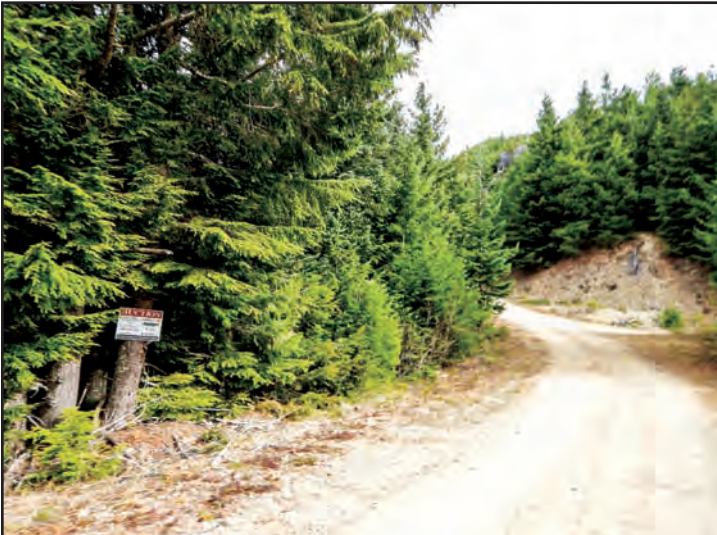
Entry in Section 24