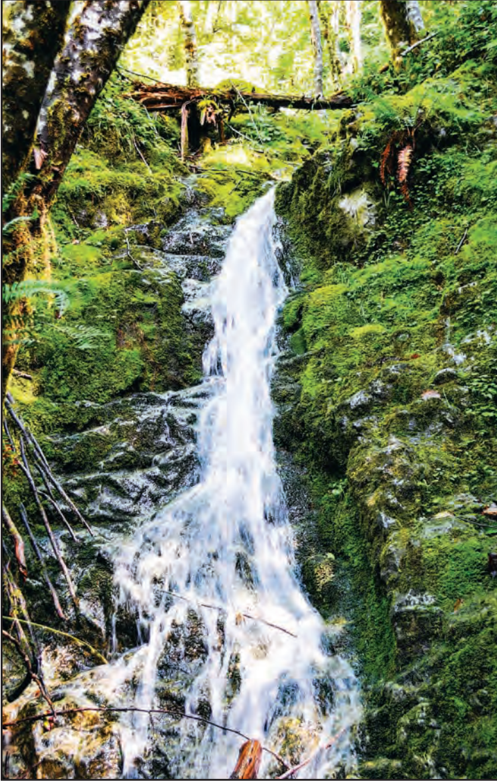
Waterfall near pond