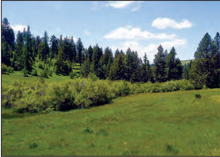
Meadow along Wilson Creek below cabin