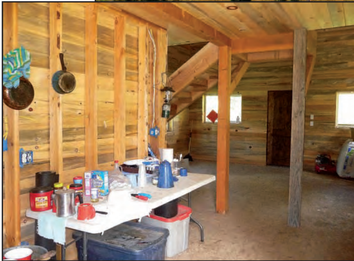
Kitchen area is ready to be finished