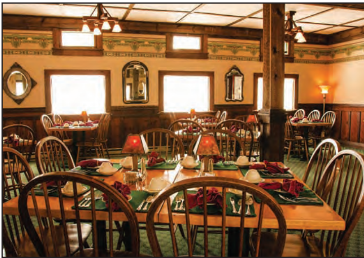
Lodge dining room on first floor is popular with guests