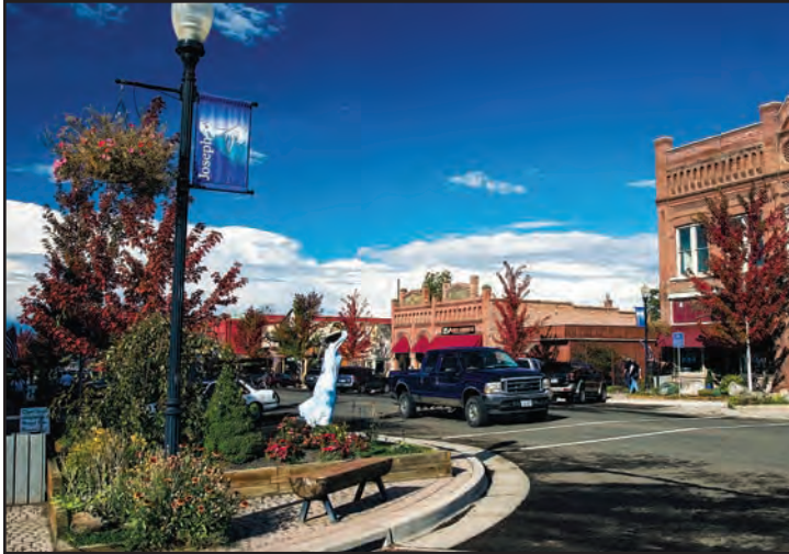
Joseph is a ten-minute drive from the lodge