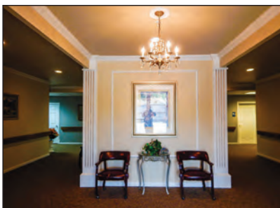
First floor is finished