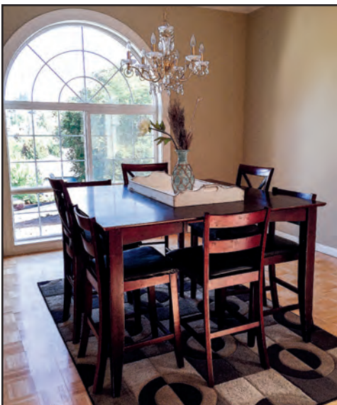
Formal dining room

The home, built in 1991 by a local homebuilder, features brick work, and an oversized garage which can hold up to five cars. The grounds are fully landscaped, including concrete patio and gazebo. The home has gas forced air heat, central air conditioning, two fireplaces, skylights throughout, carpet, tile, laminate, marble and wood flooring, and is fully-equipped with an alarm system, intercom and music.