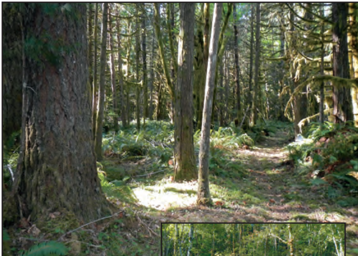
Existing trail system through Auction Property #119

Access to the 145± acre McKenzie River West property is along the northern boundary.