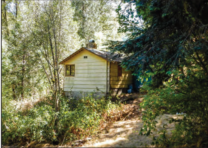
One of four Elk Creek cabins