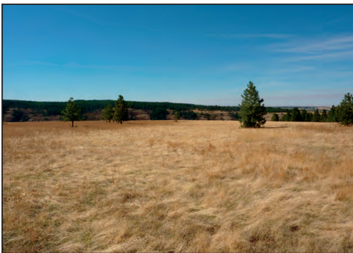
View to the northwest from ridgetop