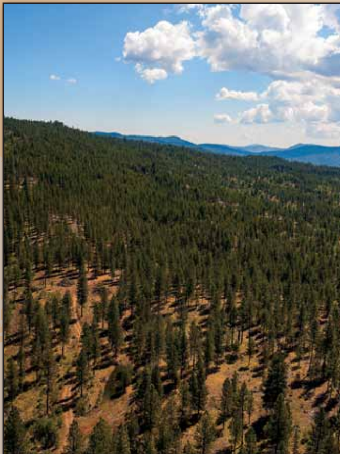
Right: Stand 4 is located in northwest section of the property, with average net 2,716 board feet per acre