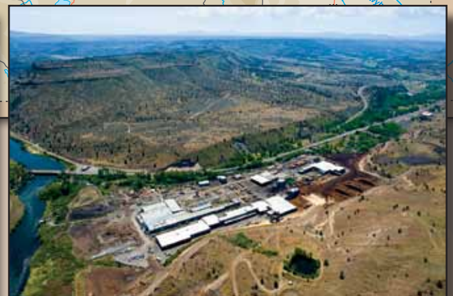
Warm Springs Forest Products sawmill