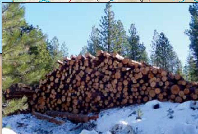
Annual harvest for last ten years has averaged 1,241± MBF