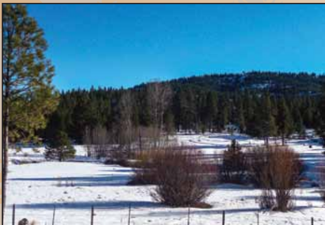
Over 141 miles of logging roads are available for snowmobiling