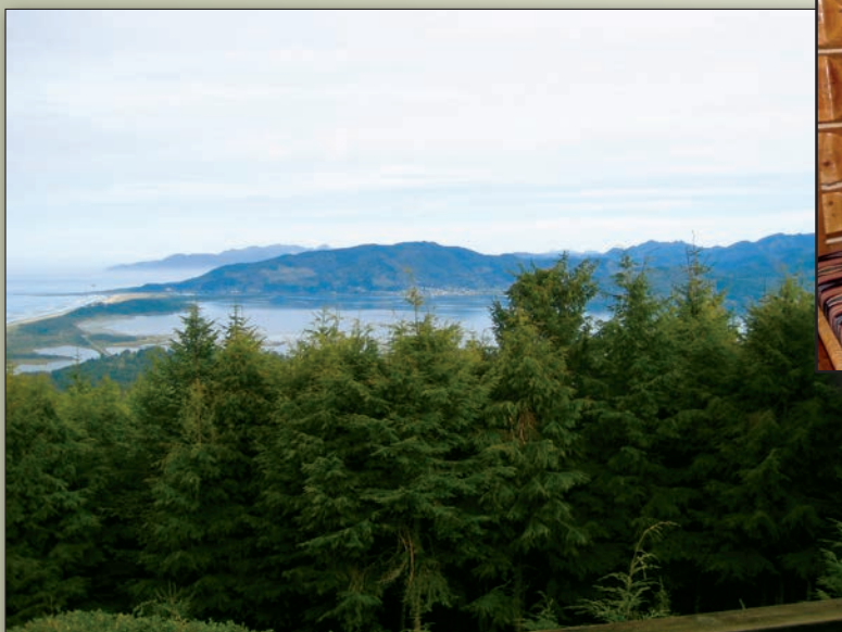
View north from Owner's Residence