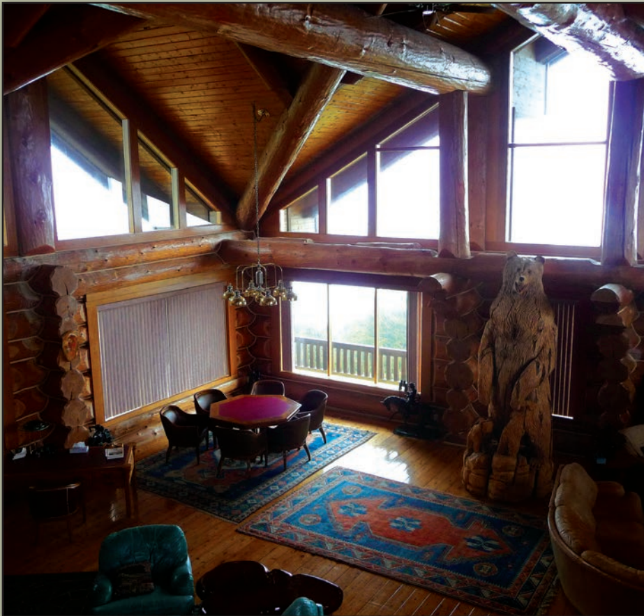
Main floor two-story great room

The Shiloh Sanctuary is near world-class ocean salmon fishing, crabbing in Tillamook Bay, and steelhead and salmon fishing in the five rivers that drain into Tillamook Bay: Wilson, Kilchis, Miami, Tillamook and Trask. It is also near excellent elk hunting in the coastal range, within both state and national forests. The nearby north coast resort communities of Oceanside, Netarts, Rockaway, and Manzanita all provide access to beaches and several golf courses. Additionally, a new owner could construct a horse barn with corral near the caretaker residence with opportunity for using the property, and its logging road system, for horseback riding and hiking.