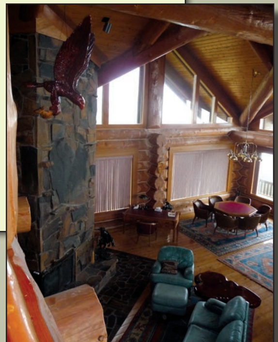
Home to be sold fully furnished, including art installations