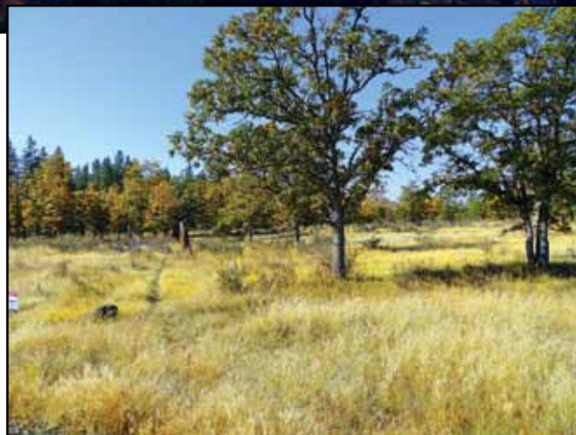
Auction Property #103

SEALED BIDS DUE NO LATER THAN 5:00 P.M., December 6, 2011